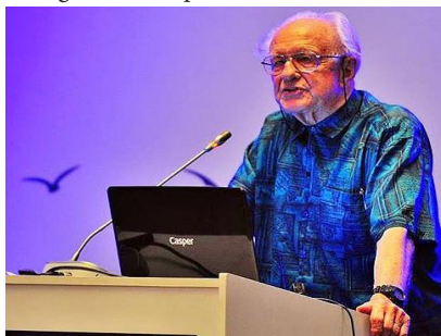
Professor Johann Galtung