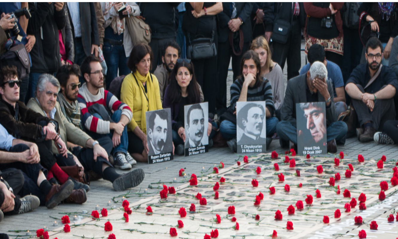
Protestors gather in Istanbul's Taksim Square to commemorate the Armenian genocide.