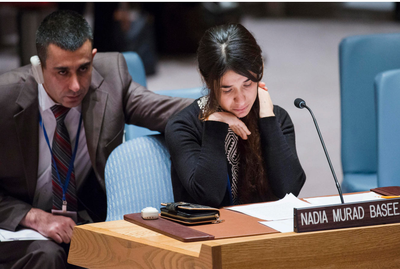
Nadia Murad, a Yazidi woman who escaped Daesh captivity, testifies about her experience in front of the United Nations Security Council. She was awarded the Nobel Peace Prize in 2018 for her outspoken advocacy on behalf of the Yazidis.