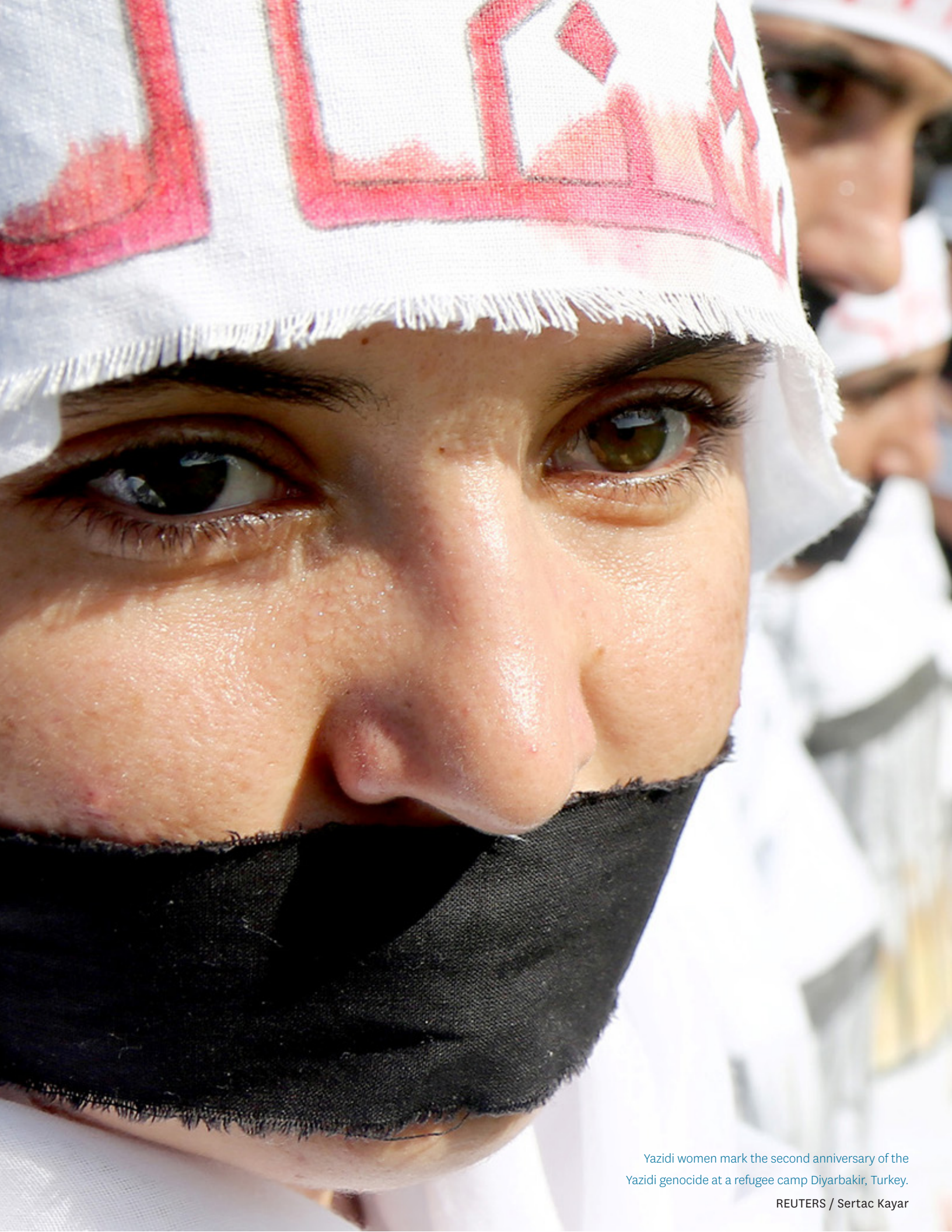
Yazidi women mark the second anniversary of the Yazidi genocide at a refugee camp Diyarbakir, Turkey.