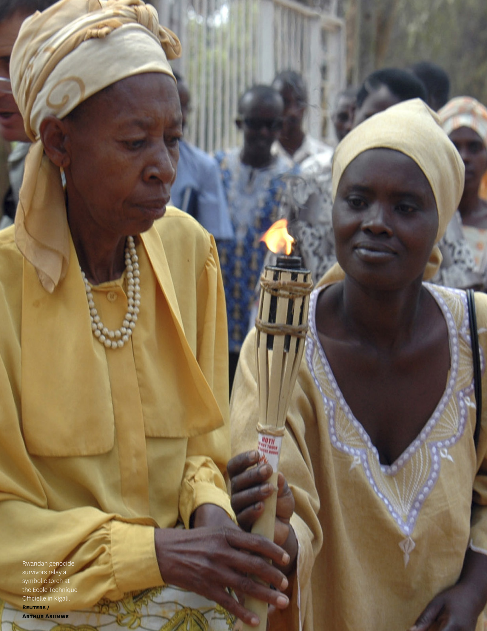
Rwandan genocide survivors relay a symbolic torch at the Ecole Technique Officielle in Kigali.