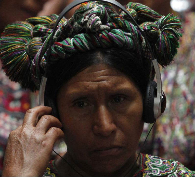
An indigenous woman from Guatemala’s Ixil region attends the trial of former dictator Efraín Ríos Montt in Guatemala City.