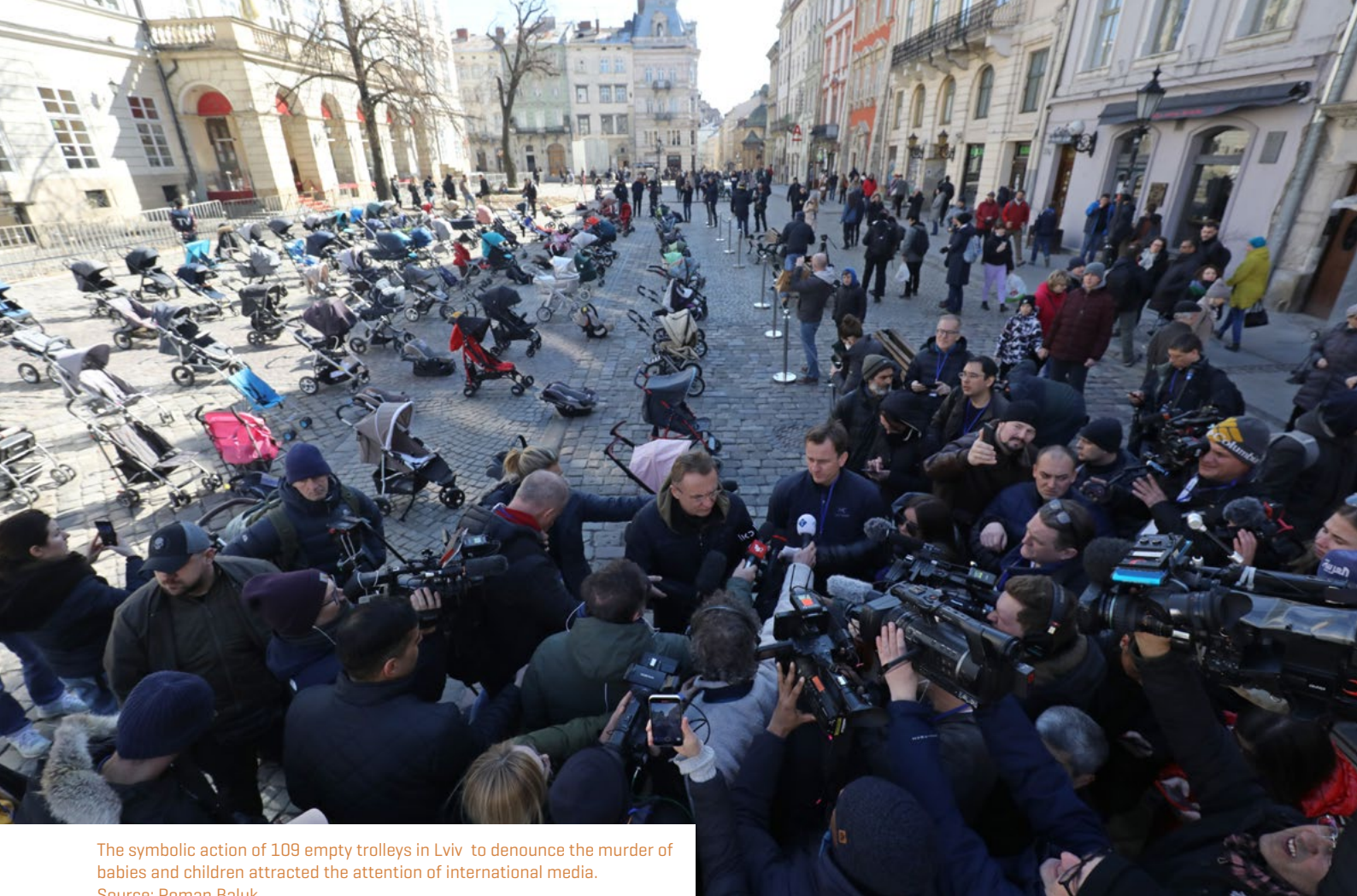
The symbolic action of 109 empty trolleys in Lviv to denounce the murder of babies and children attracted the attention of international media.